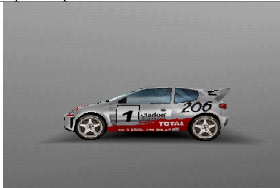
left game image