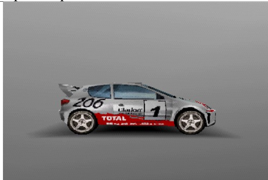
right game image