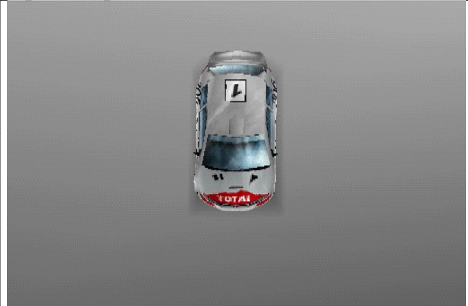
top game image